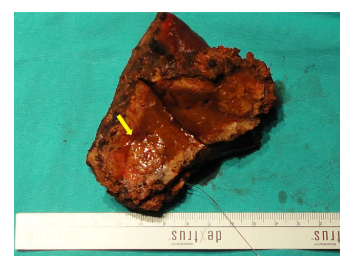
Fig. 4 Stereotactic metastasectomy specimen—the lesion was removed with negative margins

controversial [16-19]. Some has suggested that patients should be considered for laparoscopic evaluations if they have two of the following characteristics including a lymph node-positive primary tumor, a CEA level greater than 200 ng/ml, more than 1 hepatic tumor, disease-free interval less than 12 months, and a hepatic tumor greater than 5 cm [20]. Besides, IUS has been recommended to be used routinely to confirm preoperatively detected lesions and to identify additional metastases, which were not seen with previous diagnostic tools. It has been observed that IUS may discover new aspects in up to one-fourth of patients, and consequently change the operative strategy in 18 % of procedures [17-19]. RFDS-assisted metastasectomy may be an easy and bloodless technique; however, the use of the device may cause smaller lesions to be missed, since it creates a solid structure through which IUS cannot be properly used. Thus, inspiring from the experience of nonpalpable breast tumors, we have speculated that a stereotactic marking may be used for nonpalpable hepatic lesions. Current study has shown that it may be a bright idea to employ this technique for lesions smaller than 1 cm, especially if an RFDS-assisted resection is initiated, since a complete resection of the identified lesion was achieved in all cases.