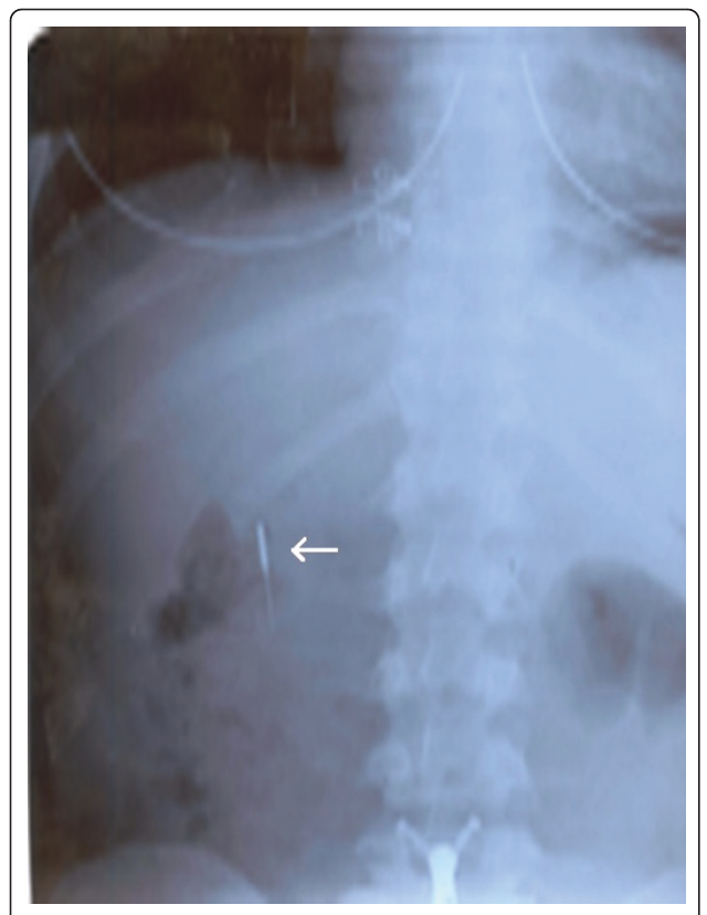
Figure 1 A plain abdominal radiography (PAR) revealed a needle located in the upper abdomen.

that the needle was located in the lower lobe of the left lung (Figure 4). Also, there was no intestinal contrast leakage in CT. Therefore, it was decided to perform an emergent thoracotomy. Fluoroscopy and finger palpation were used to verify the exact location of the needle during the operation and the needle was removed after pneumotomy. The postoperative period was uneventful and the patient discharged from the hospital on the day 5.