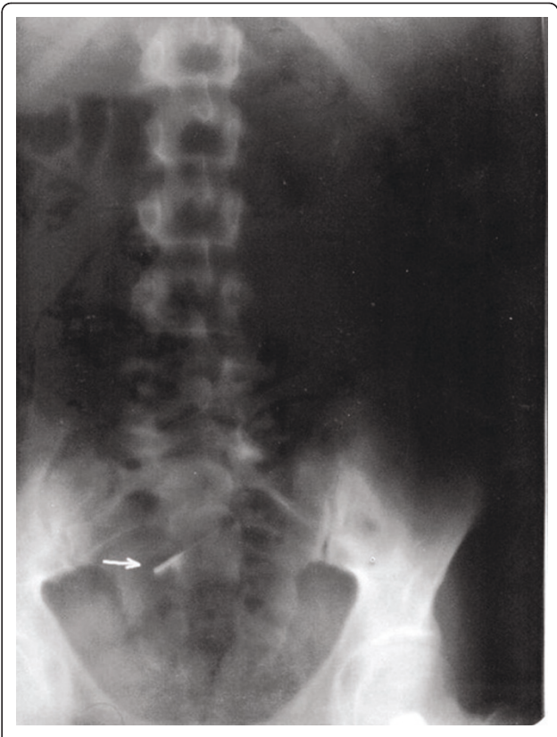
Figure 2 The needle had passed to the terminal ileum and transverse colon.

The incidence of foreign body ingestions is unknown. The most common causes of foreign body ingestion are accidental swallowing of objects. Children usually put any object they find into their mouths and may accidentally swallow them. In healthy adults, accidental swallowing often involves toothpicks, dentures and turban pins. Psychiatric patients may swallow a wide variety of objects, including large and bizarre items. Although the majority of foreign bodies pass harmlessly through the GI tract and conservative management is generally recommended, 10% to 20% of them will require nonoperative intervention such as endoscopy, and approximately 1% of them will require surgery [9-11]. An